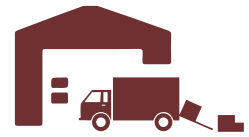
Logistic and Warehouse