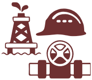
Oil, Gas and Mining